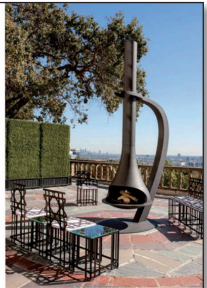
The main guiding principle behind these pieces from 22 22 Edition – designed by Jean-Claude Cardiet and manufactured in France – was "to make life like a dream". The collection comprises outdoor furniture, decorative accessories and creative lighting fixtures: www.2222editiondesign.com