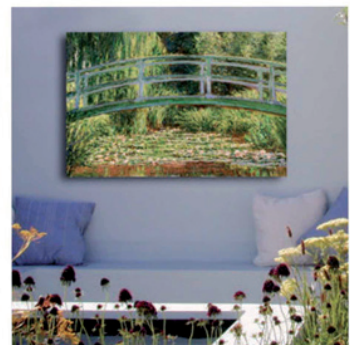
Insideout Garden Art have launched a selection of fully weather-proof box-framed canvases for 2014 featuring the work of Monet, ideal for adding year-round colour to patio areas and lacklustre garden walls: www.insideout-gardenart.co.uk